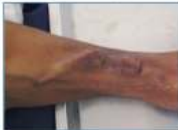
BASILIC VEIN TRANSPOSITION