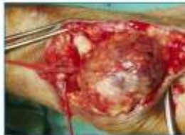
PSEUDOANEURYSM REPAIR (PRE)