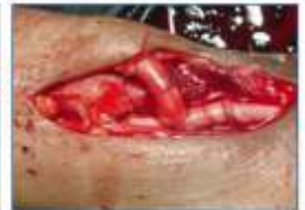
PSEUDOANEURYSM REPAIR (POST)