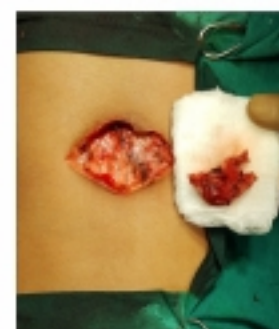
BACK AVM SURGERY