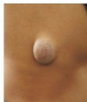
BACK AVM SURGERY